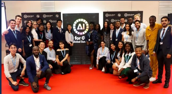
WSIS+20 & AI for Good Summit @ ITU, Geneva, Switzerland