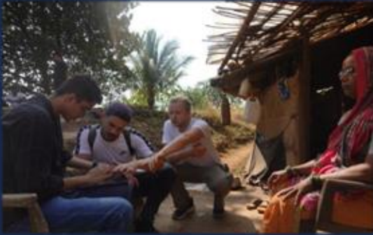
Field Research: Social Impact of Energy & Internet Access @ Jharkhand, India