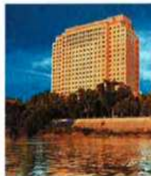
Along the serene Songhua River

Around the city, buildings are embellished with spires and cupolas. Many remain untouched since the Russian Revolution. This blend of Asian and European