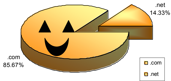
Figure 3 – TLD Registrations Distribution October 31, 2003

Figure 3 shows the percent of second-level domain names registered in each of the .com and .net gTLDs as of the end of the current reporting month.