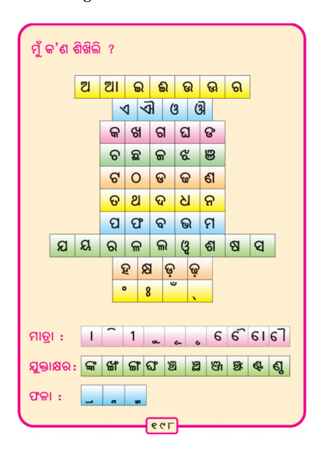
Figure 4: Odisha State Govt. Primary School Grade 1 e-book (Page 112)

Odisha State Government Primary School Grade 1 e-book "HasaKhela" [105] page 112 lists all the Oriya characters as shown in Figure 4.