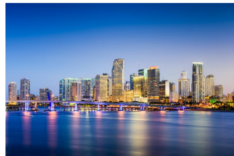
Miami, Florida United States of America