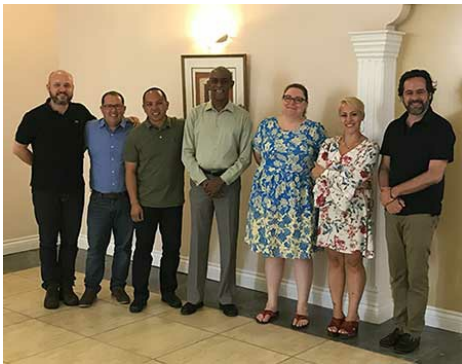
ICANN LAC team gathers in Saint Lucia for the regional all-hands meeting.