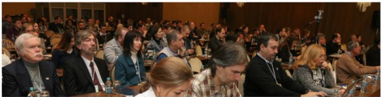
The two-day long event sparked valuable discussions among participants.