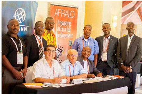
ICANN organization and community members meet at AFRINIC-25.