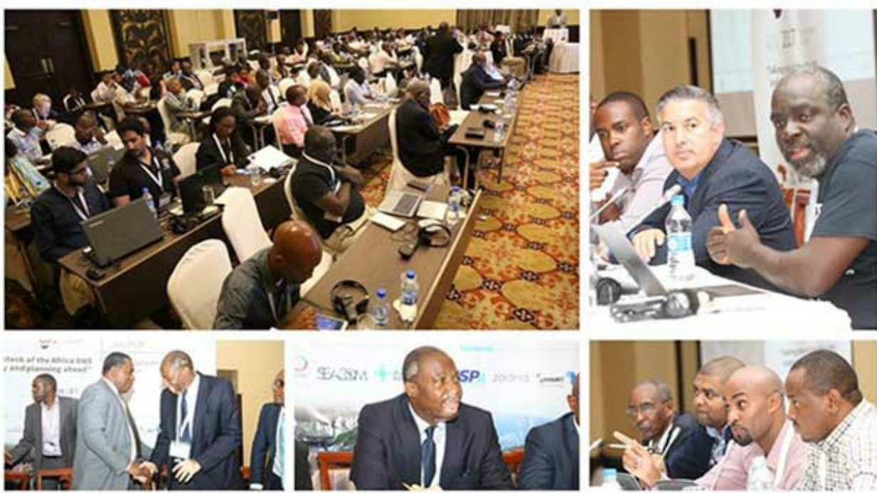
The fifth Africa Domain Name System (DNS) Forum attracted over 200 local and regional participants.