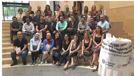
This year, MEAG-SIG drew 31 participants from 13 countries.

Recommendations coming out of this work will be subject to approval by the SEEDIG community. After approval, the next step will be to launch an election process for the new executive committee this September. For updates about this initiative, watch this space: http://www.seedig.net/ .