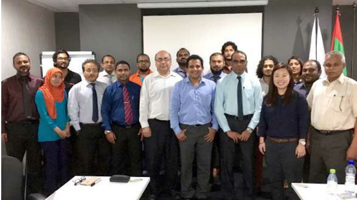
ICANN and members of the Maldivian community explore the formation of a GP for the Thaana script.

ICANN held a series of engagement activities in Male, Maldives, from 5-7 December 2017. In addition to organizing technical and capacity-development workshops in cybersecurity and Internationalized Domain Names (IDNs), ICANN met with Chief Executive Officers (CEOs) and Chief Information Officers (CIOs) of government and technical agencies. The events raised awareness about ICANN in general and emphasized the importance of: