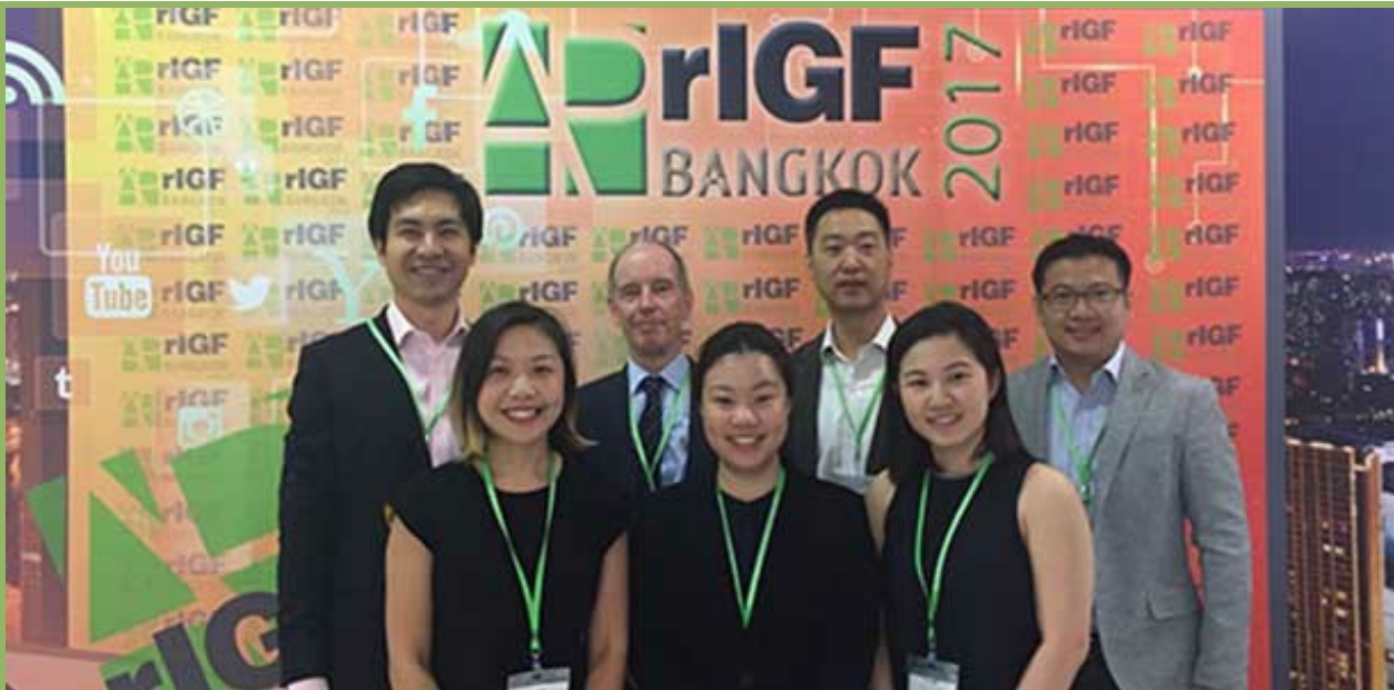
ICANN staff at the Asia Pacific Regional Internet Governance Forum 2017