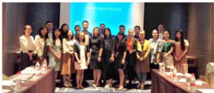
Top and bottom left: The workshop in Cambodia sparked interest among community members who were curious about the best practices of various dispute resolution mechanisms.