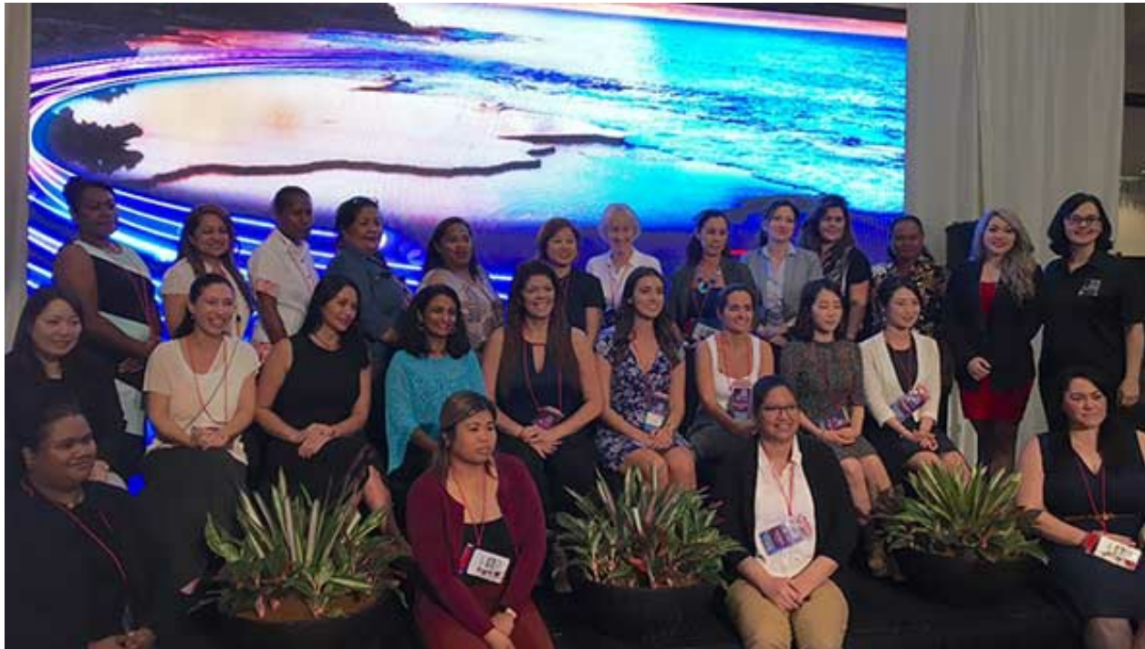
ICANN attended the 22nd Pacific Islands Telecommunications Association Annual General Meeting from 23-27 April, which saw huge participation from women in the industry.

The Pacific region has experienced an increase in information and communications technology (ICT) infrastructure provisioning in both undersea cables and satellite operators. This change has enabled national service providers to meet consumer bandwidth demands. Recently, the Pacific Islands Telecommunications Association (PITA) held its 22 nd Annual General Meeting and tradeshow in Guam to discuss topics such as: