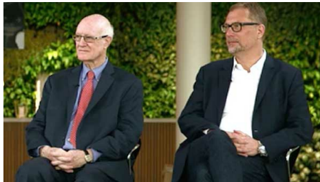
Click here to watch the interview.