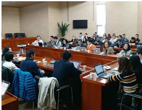
Chinese community members gather at the ICANN58 readout session.

There has been an increasing interest in IDNs and Indic content following the success of ICANN57 in Hyderabad, India, especially from the Indian business community, through the Internet and Mobile Association of India (IAMAI). On 8 March 2017, an NBGP Industry Onboarding meeting was held in New Delhi to welcome new business community participants into the panel. ICANN hopes to keep the momentum going and bring in business, technical and academic community members to complete the work of the NBGP.