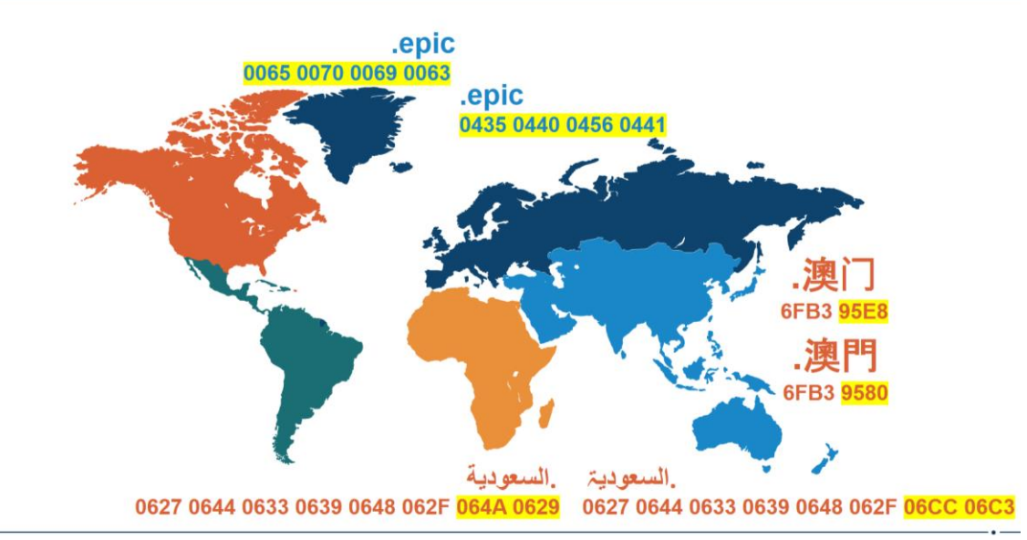
Figure 1: Examples of Cross-Script and Within-Script Variant Labels

To address these complex linguistic, technical and policy issues, ICANN org first <u>undertook an initiative</u> to engage six script communities that identified requirements of variants for these scripts. For a holistic understanding of the range of possible challenges, the scripts studied had represented a range of script types: Alphabetic (Latin, Cyrillic and Greek), Abjad (Arabic), Abugida (Devanagari) and Ideographic (Han Chinese). Experts from these communities undertook detailed analyses, undertook open public feedback on the issues identified for these scripts (Arabic, Chinese, Cyrillic, Devanagari, Greek, Latin) and then published their reports in 2011. As anticipated, these case studies demonstrated a significant variety in the types of variant code point issues.