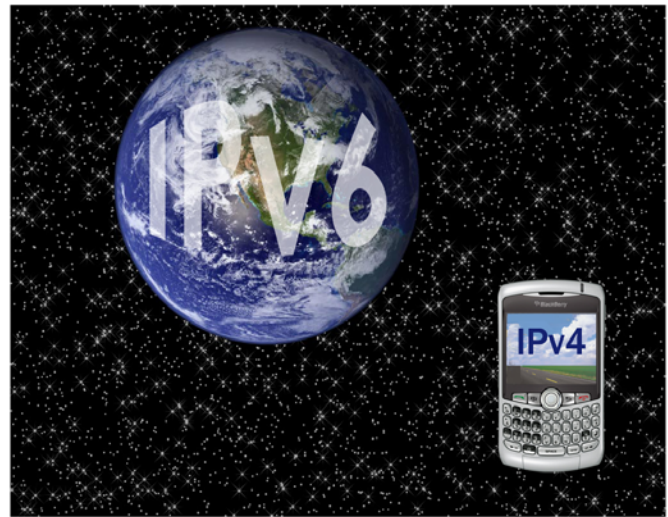
An IPv4/IPv6 size comparison: if all the IPv4 addresses could fit within a Blackberry, it would take something the size of Earth to contain IPv6

networks running IPv6 before 2011. Mexico's domain registry, NIC.mx, have stated they will stop allocating IPv4 on 1 January 2011.