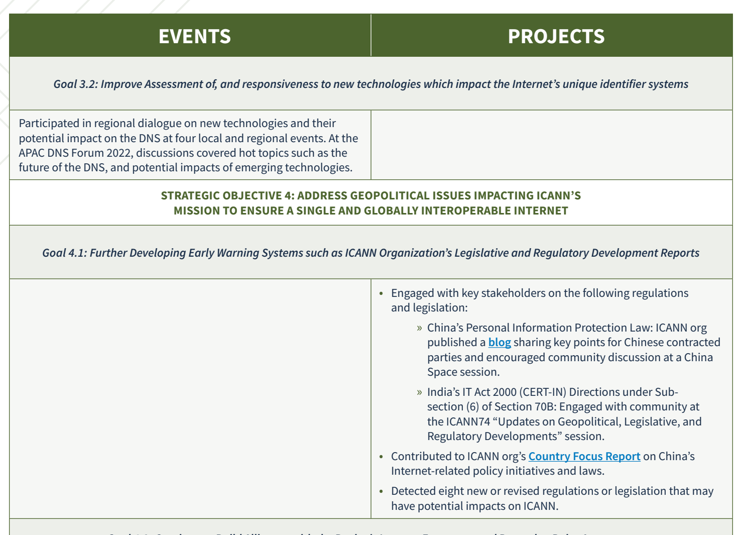
Goal 4.2: Continue to Build Alliances with the Region's Internet Ecosystem and Beyond to Raise Awareness of and Engage with Global Stakeholders about ICANN's Mission and Policy Making