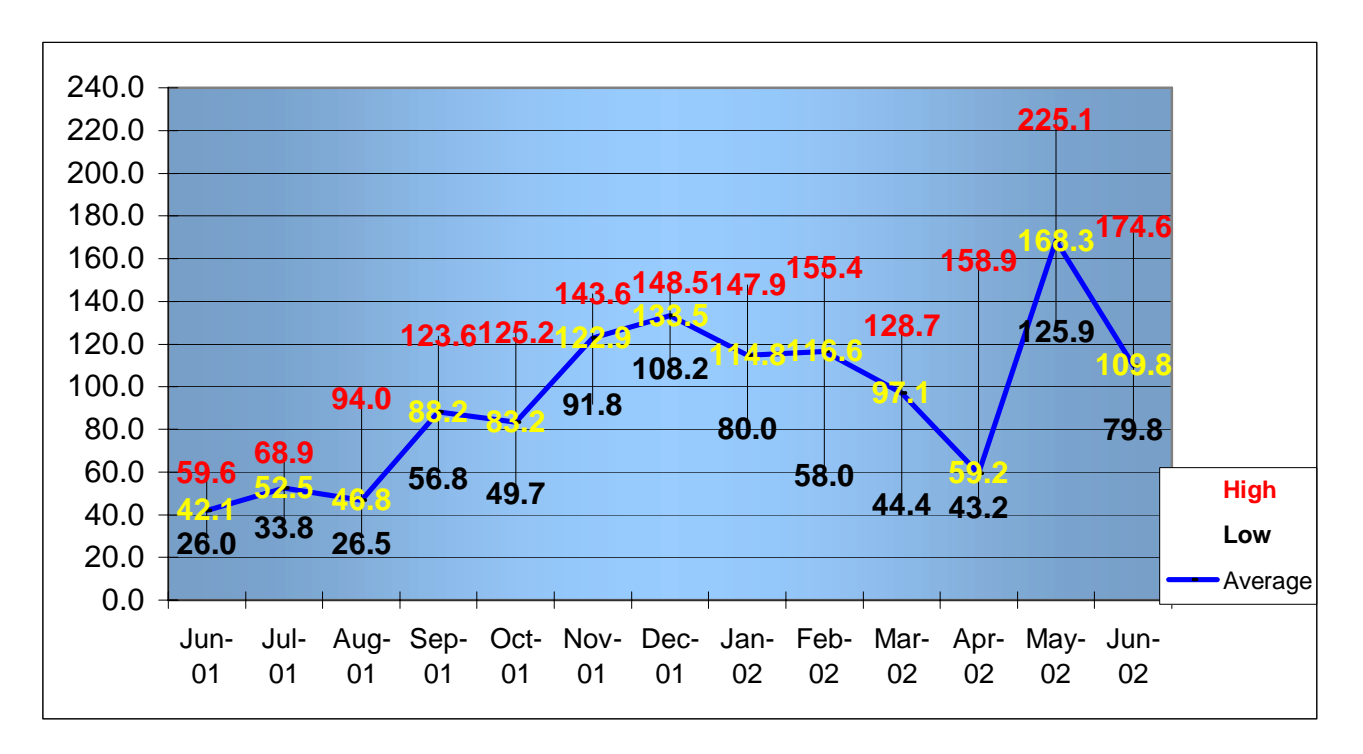
Figure 1 – Average Daily Transaction Range