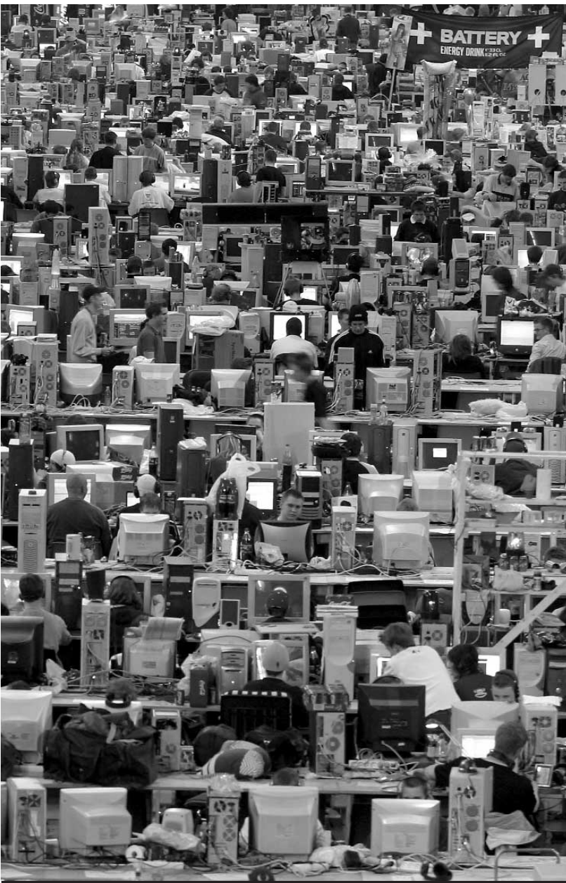
Every year 5,000 people gather at the world's largest computer convention in Hamar, Norway.